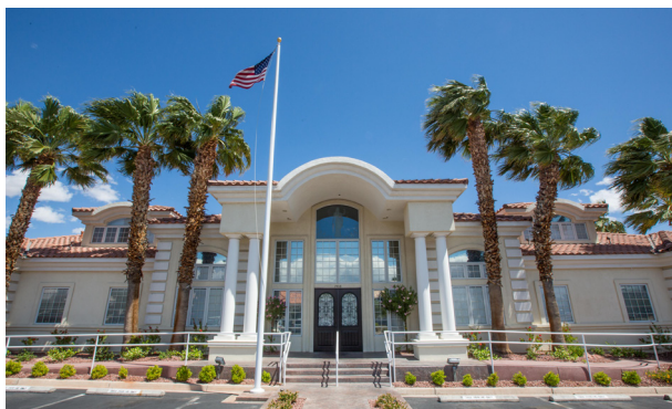
Las Vegas Office - 7408 West Sahara Ave., Las Vegas, NV